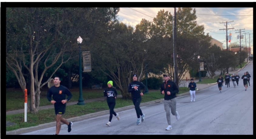
Rowdy Inman race participants