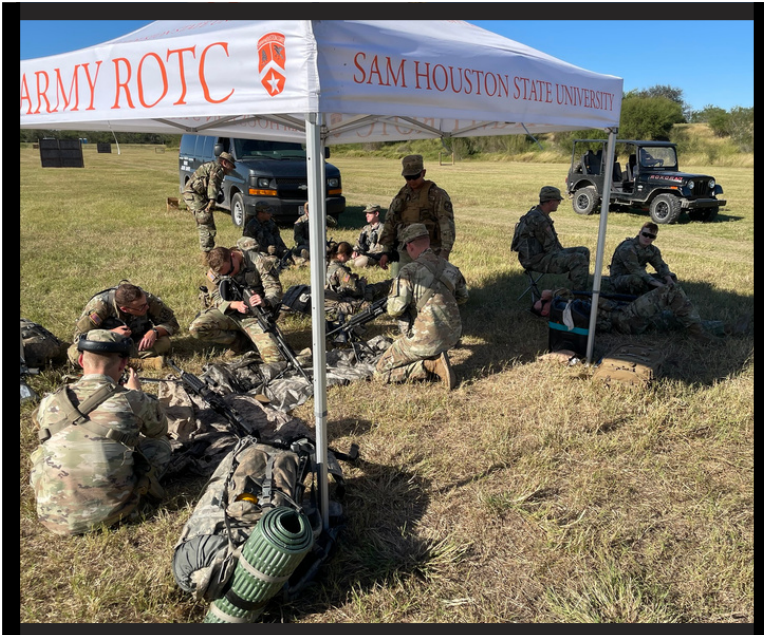
Cadets cleaning their weapons after the FTX