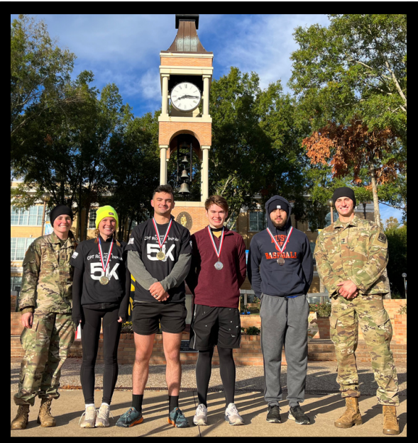
WINNERS OF THE 5K