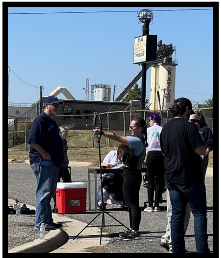
Part two of the Oklahoma City Police Department Physical Agility Test