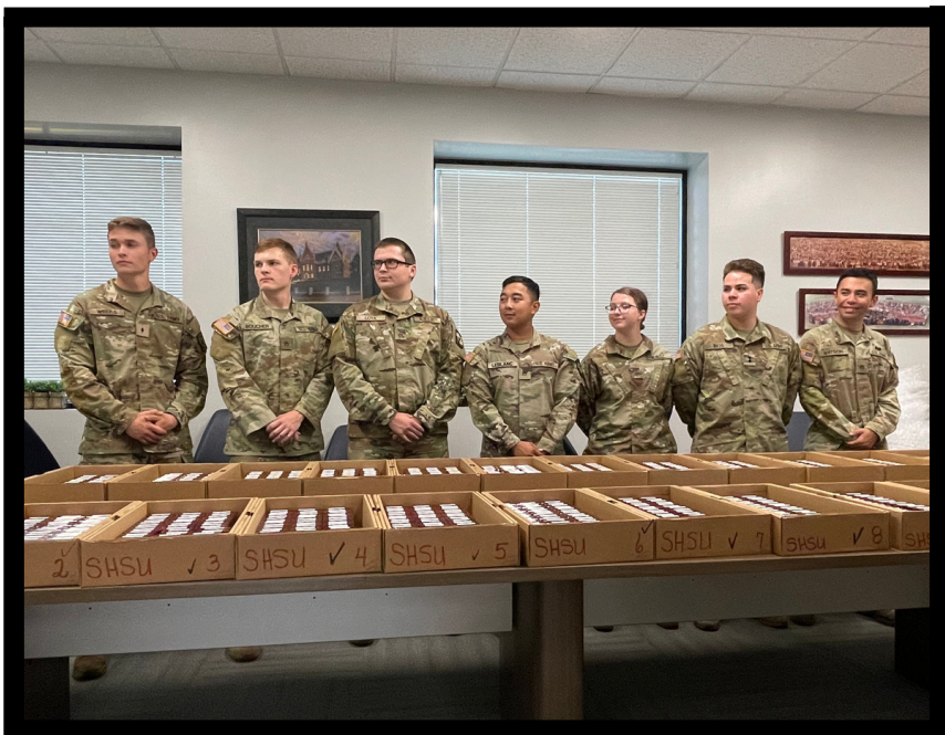
CDTs delivering the rings to Sam Houston's house