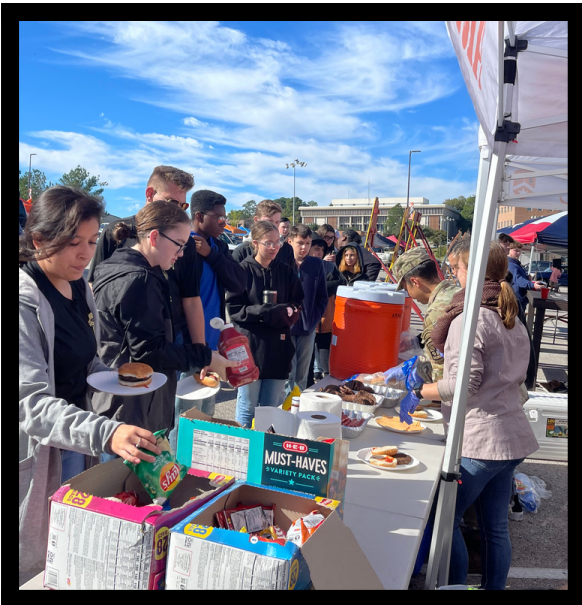
Bearkat Battalion serving over 250 JROTC CDTs at the Sam Houston State University v. Abilene Christian University game