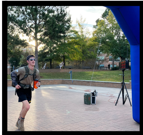
CDT Taravella finishing the 5K strong!