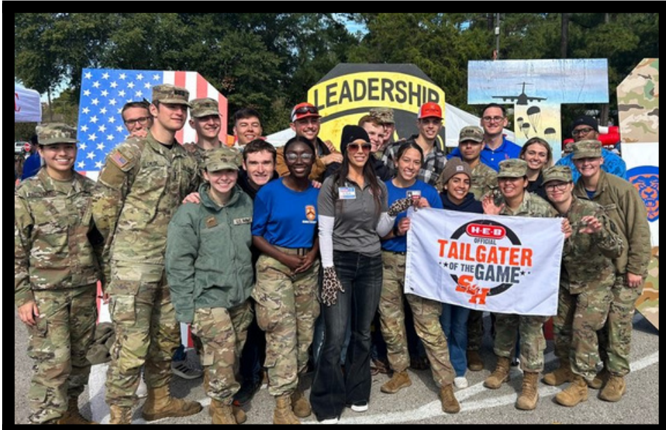
Bearkat Battalion won best Tailgater prize at the SHSU v. ACU game