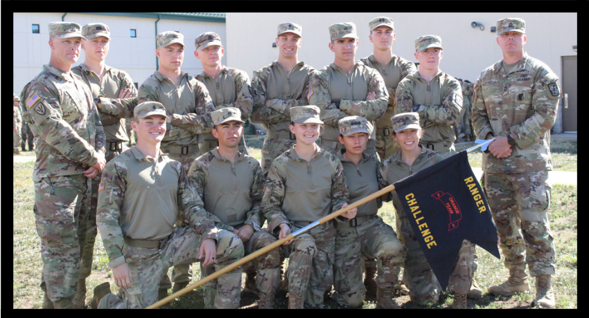
A 4th place finish after a 13 year dry spell shows how hard these cadets worked and how talented they are