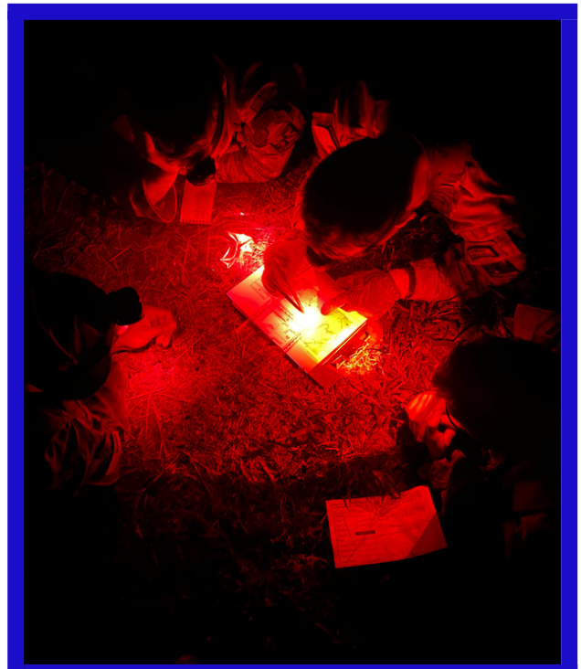
Cadet plotting their points during Night Land Navigation