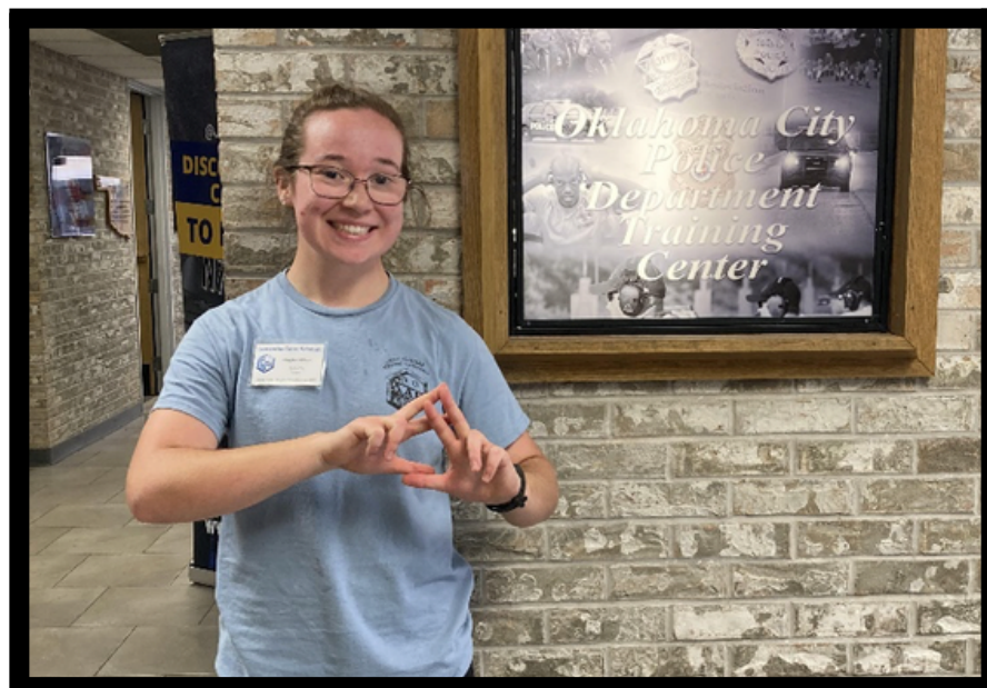
CDT Gaus-Schmidt Inside the Oklahoma City Police Department Training Center after completing physical agility test