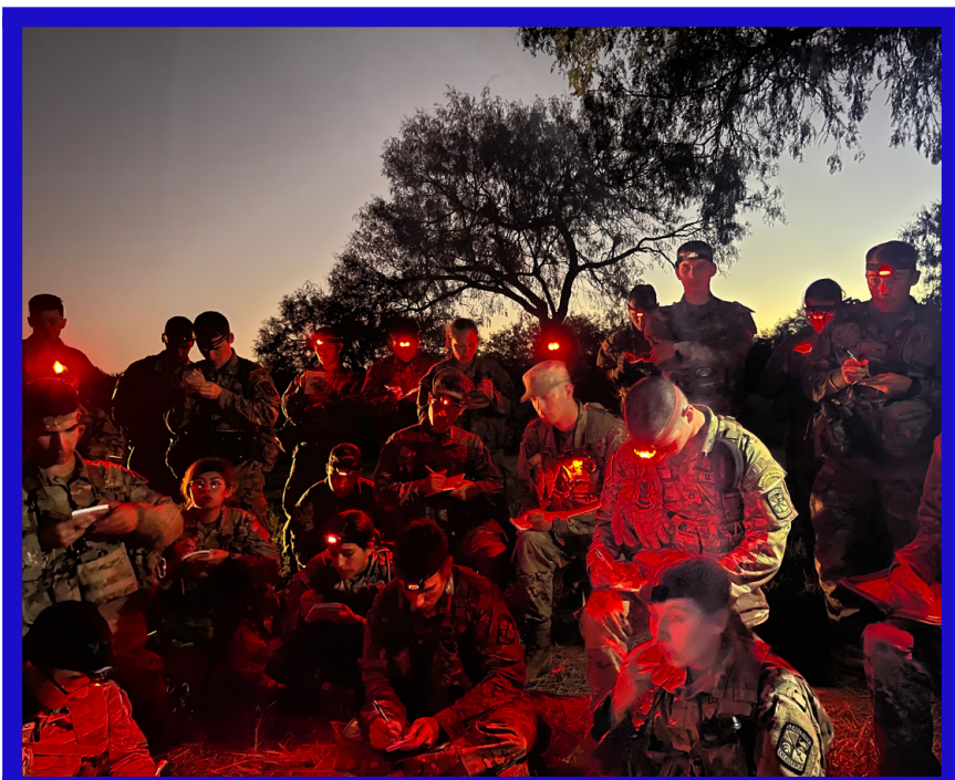
Cadets receiving their mission for the second day of the FTX