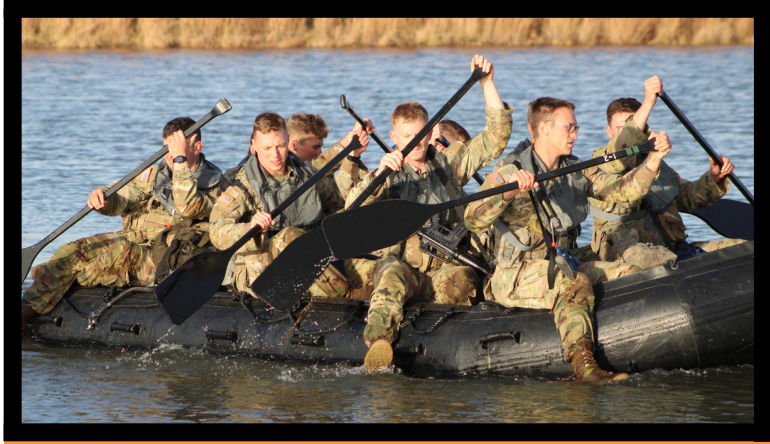
It was a brisk morning for a paddle but the whole Ranger Challenge team filled the Zodiak and paddled the "U" shaped course